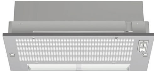
05/01 DHL 535 C